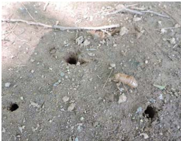
Periodical burrows and a molt.

Periodical cicadas emerge on prime numbered years, either 13 or 17. The 13 year ones are restricted to the South.