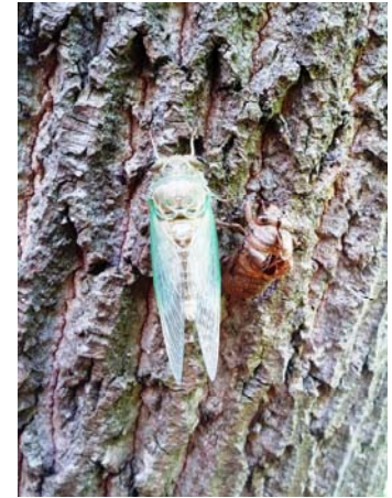
A freshly emerged, or teneral, cicada, still white and soft.

So enjoy this natural phenomenon while you can. These "locust" don't spread disease or eat our crops. They can pro-