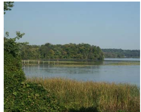
The Potomac River as it flows by Hunting Creek near the Dyke Marsh Wildlife Preserve.

FODM welcomes cosponsors the Four Mile Run Conservancy Foundation, Porto Vecchio Condominium, the