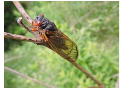
Periodical cicadas will be emerging from mid April to June.

America having them. This is a natural phenomenon where cicadas form huge choruses by species. For while they may seem the same, there are actually three species that emerge together to then attract their specific females. Each male chorus (for only the males call) has its own species specific songs to attract their mates and they group together for best effect. They last for 5-6 weeks as adults. You will start to notice the burrows as they emerge, or occasionally chimneys that they form when digging out and then the empty molts of old skins from the emerging nymphs. Most periodical cicadas have red eyes, but some also have white or grey eyes.