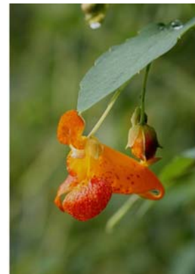
Orange jewelweed flower.

The juice in the stem of orange jewelweed and yellow jewelweed can be used to prevent the rash caused by poison ivy, to wash the oil of poison ivy off the skin and to relieve the itch of the rash.