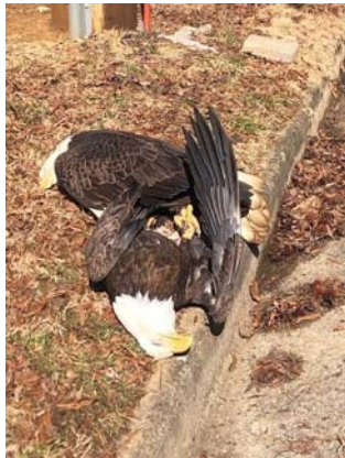
Two dead bald eagles with interlocked talons, found in the Mount Vernon area on February 17, 2021.

Dyke Marsh again has three active bald eagle nests. Unfortunately, Northern Virginia lost two bald eagles on February 17 when they died just a few miles west of the marsh.