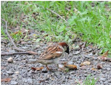
A house sparrow feeds on a periodical cicada.

The egg laying inside these slender twigs causes many to die off. They often wilt and hang down, while others may break off. The wilted and hanging branches are referred to as flagging. Cicadas are picky as to which tree (they don't disturb plants or ferns) they choose to insert their eggs in. They are usually 6 feet or more tall, mostly at the edge of mature woods, where's there some sun, and usually have pencil-sized stems to oviposit in. They tend to avoid lawn areas with small shrubs unless they're near mature woods. For those people who were around the last time cicadas emerged, they normally use the same places to try and lay eggs again. They don't like to use any evergreens, sumacs, pawpaws, many viburnums, euonymus, or Osage orange. Studies have shown that healthy trees don't show long term ill affects. Think of it as natural pruning that has been going on for millennia. If you do want to be cautious, leave your tree planting until the fall. Or protect your trees with 1.0cm netting (but beware that this may trap birds and snakes), but