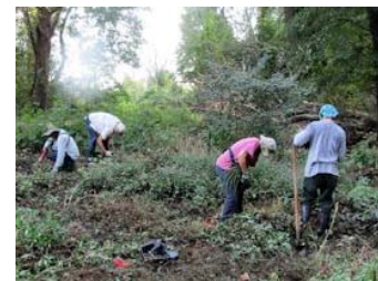
FODM volunteers clear invasive plants.

The park also shared with the public the South GWM Parkway safety study. U. S. Representative Don Beyer advocated for the study on behalf of the community to address your safety concerns. In addition to the press release and media inquiries, we have spoken with nearly 70 members of the community. We were invited to the Mount Vernon Council of Citizens' Associations combined Transportation and Public Safety Committee meeting. We also engaged our local, state, and federal officials regarding the study. We will be awarding a contract this year to stripe the south parkway and implement the road diet as part of the project. Between Tulane Drive and Stratford Lane, we will change markings so that there will be three travel lanes (two northbound, one southbound and one center turn lane). The report has a lot of data, information, analysis and recommendations for the park to consider and implement. You can read the complete report and appendices at https://parkplanning.nps.gov/projectHome.cfm?projectID=89079 .