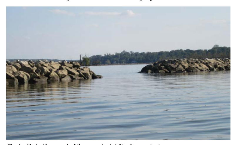
Rock sills built as part of the marsh stabilization project

We expect to add rock material without exceeding the original height of the sills. We completed the stabilization project in 2022.