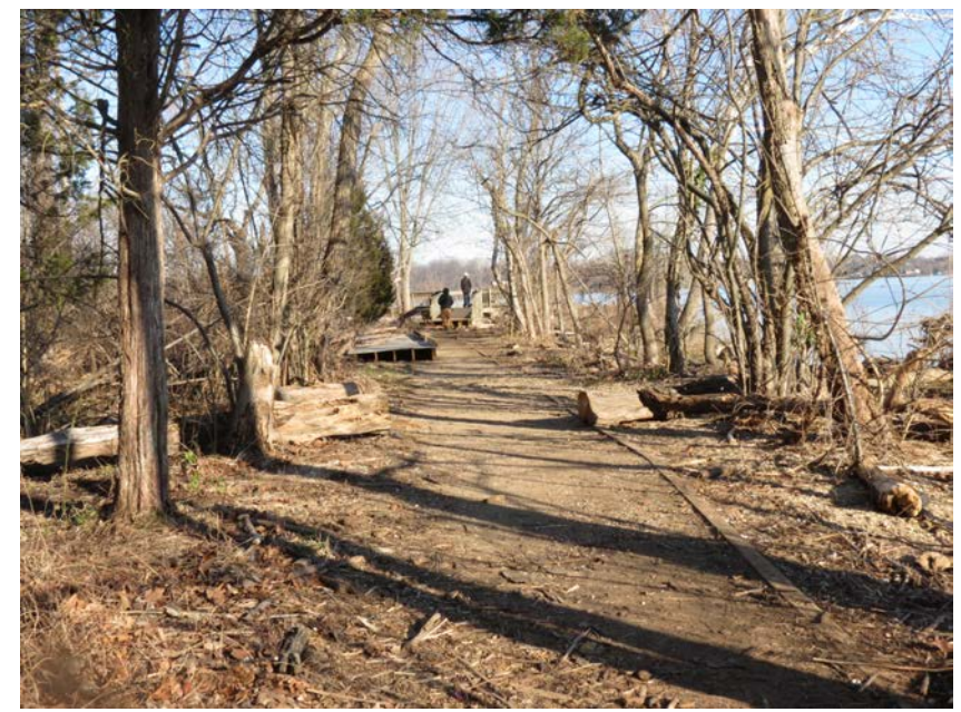
Haul Road trail with damage from a January 2024 storm, flotsam washed up and a displaced ramp to the boardwalk

In the Washington, D.C., region, sea level increased 13.5 inches in the last 100 years (averaging 3.43 millimeters a year). However, the rate of change was fastest in recent decades so we can expect more rapid changes moving forward. Curiously, sea levels actually vary throughout the year, being highest in September, which overlaps with hurricane season, making the area