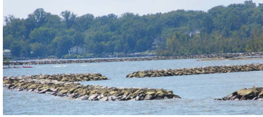
The Corps of Engineers built a breakwater (in the distance) to replicate a former promontory and five stone sills (foreground) for further protection.

The good news is that with the support of FODM and a "Hurricane Sandy" grant, NPS built stabilization structures that may help slow erosion and increase accretion in the marsh, enhancing the chances it can compete with sea level rise. In 2020, the National Park Service and U.S. Army Corps of Engineers constructed a 1,500-foot-long (about one-third mile) breakwater at the southern end of the