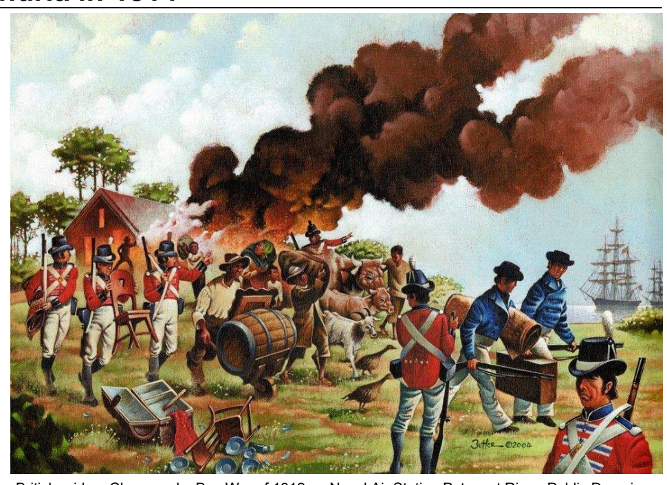
British raid on Chesapeake Bay War of 1812 Naval

When most Americans think of British invasions, we think of when the Beatles arrived on our shores in 1964, bringing a new sound to rock-and-roll music. Others may think about the War for American Independence. Between the two, the War of 1812 stands as a second