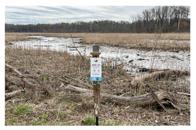
Chronolog station on the Haul Road trail

To keep up with rising costs, we will raise annual household dues from $15.00 to $20.00 effective July 1, 2024. You will get a notice when your membership expires.